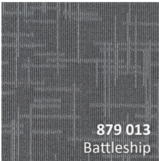
879 013 Battleship