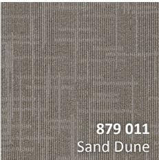
879 011 Sand Dune