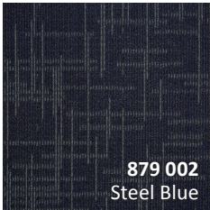
879 002 Steel Blue