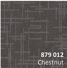
879 012 Chestnut